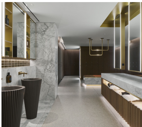
Marble Showers and Bathrooms