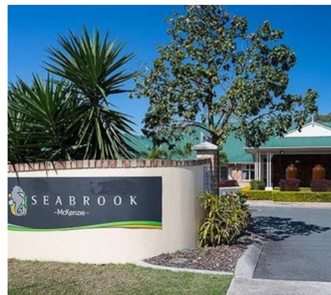
Kitchen Area, Aged Care