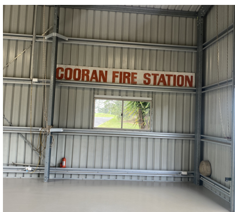
Cooran Fire Station