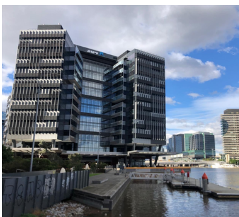
ANZ HQ: various surfaces