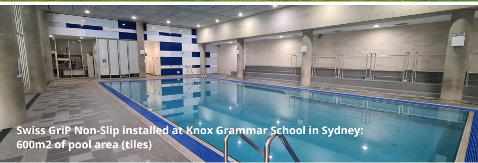
Swiss GriP Non-Slip installed at Knox Grammar School in Sydney: 600m2 of pool area (tiles)