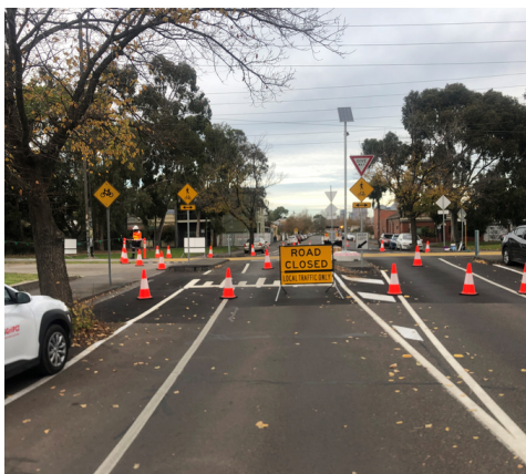
Historic Railway Line