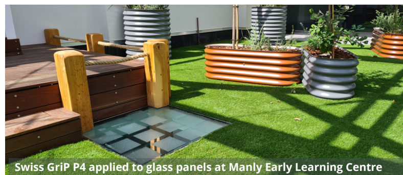
Swiss GriP P4 applied to glass panels at Manly Early Learning Centre