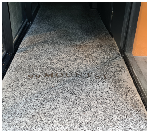
Epoxy car park & Entry area