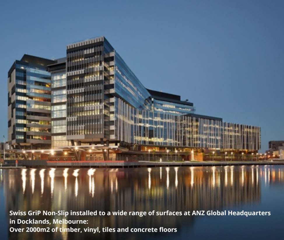
Swiss GriP Non-Slip installed to a wide range of surfaces at ANZ Global Headquarters in Docklands, Melbourne: Over 2000m2 of timber, vinyl, tiles and concrete floors