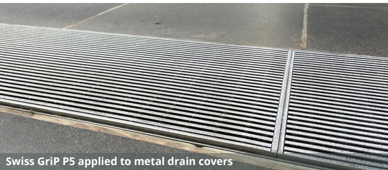
Swiss GriP P5 applied to metal drain covers