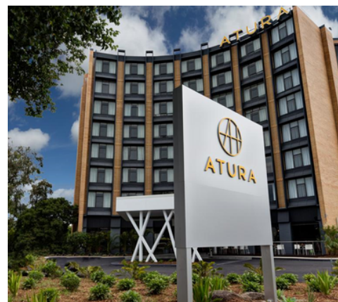
Atura Hotel: Kitchen