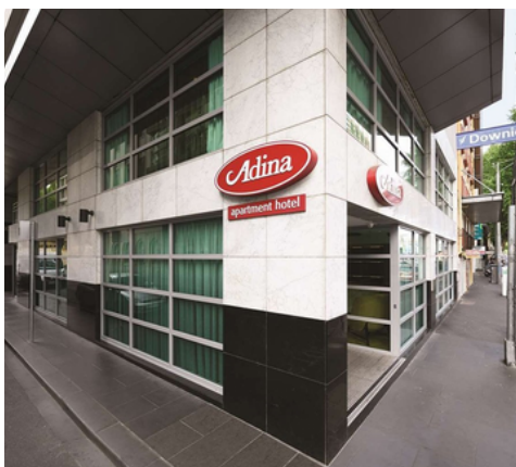
Adina Apartment Hotel: Pool