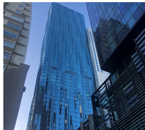
Melbourne: Poly-Marble Bathtubs