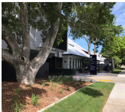
Aged Care Entry Area