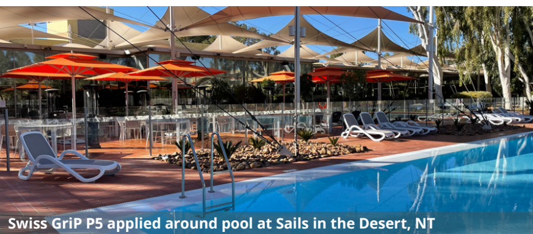
Swiss GriP P5 applied around pool at Sails in the Desert, NT