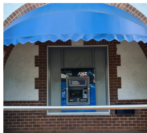
ANZ Entry Area